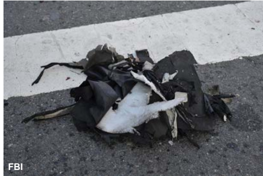
(U//FOUO) Remains of the backpack

(U) On 15 April 2013, at approximately 2:50 p.m., two explosions occurred in quick succession near the finish line of the Boston Marathon, killing at least three people and causing numerous injuries. Preliminary findings reveal the two devices were located less than a block apart, and functioned within approximately 10-15 seconds of each other. Both devices were concealed in backpacks and placed where spectators were gathered.