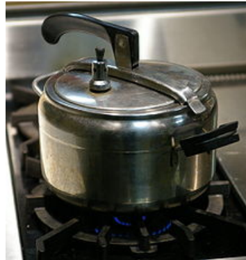
(U) Pressure cooker

(U//FOUO) Further post-blast analysis and chemical analysis is necessary to confirm the presence of these components and the identity of the main charge explosive. Collection of evidence is ongoing and forensic and technical analysis will be forthcoming.